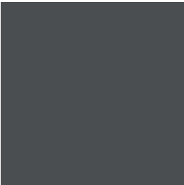
Charcoal TSR: 7%